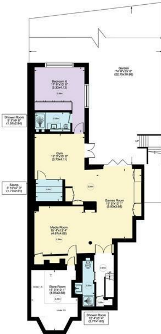
Lower Ground Floor - Approx 126 Sq m - 1360 Sq ft