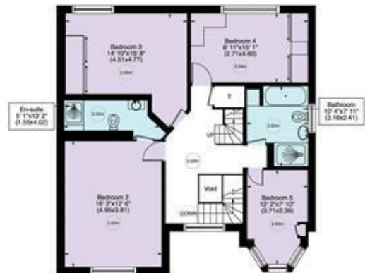
First Floor - Approx 87 Sq m - 937 Sq ft