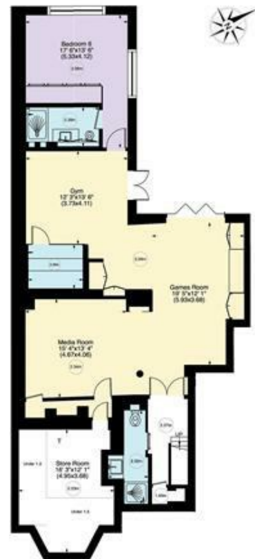
Lower Ground Floor - Approx 126 Sq m - 1360 Sq ft