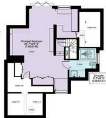
Second Floor - Approx 66 Sq m - 708 Sq ft