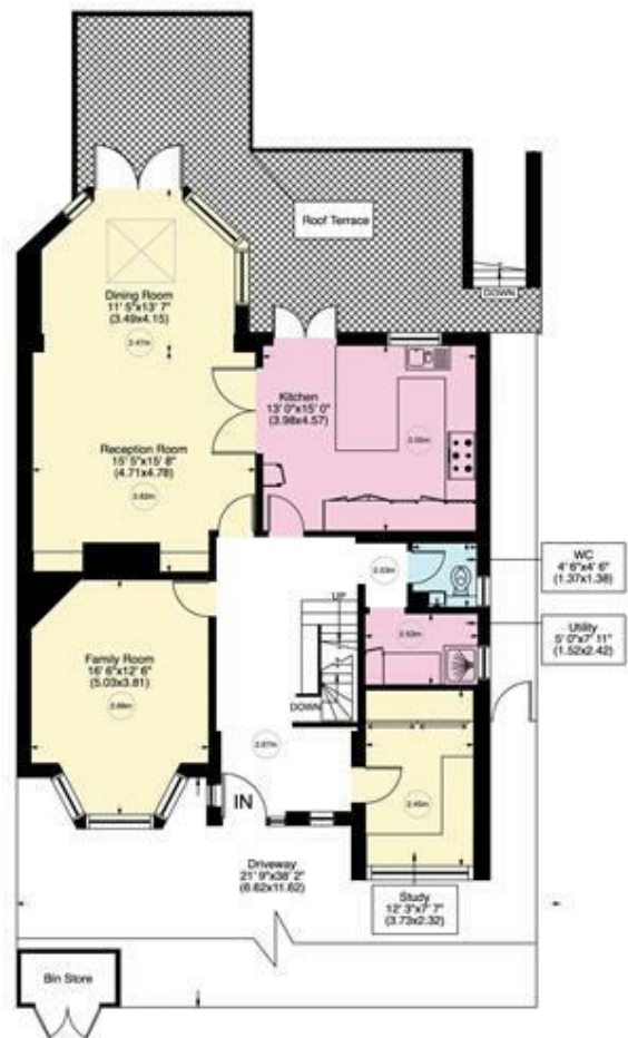
Upper Ground Floor - Approx 108 Sq m - 1164 Sq ft

Not to Scale, for guidance only and must not be relied upon as a statement to fact. All measurements areas are approximate only (and have been prepared in accordance with the current edition of the RICS Code of Measuring Practice).