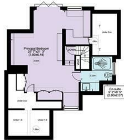
Second Floor - Approx 66 Sq m - 708 Sq ft