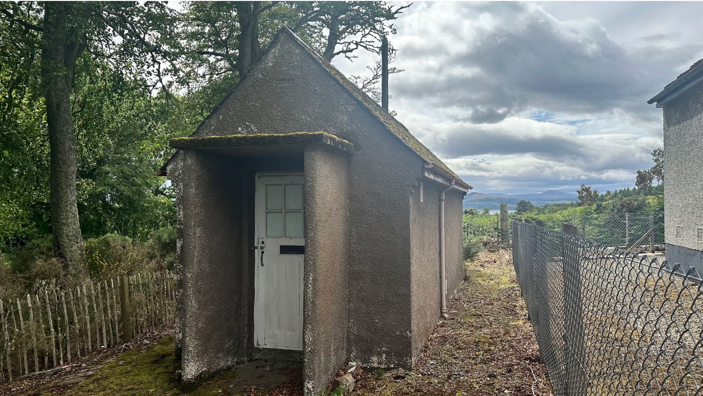
Old Telephone Exchange, Whiteface, Dornoch, Sutherland IV25 3RJ