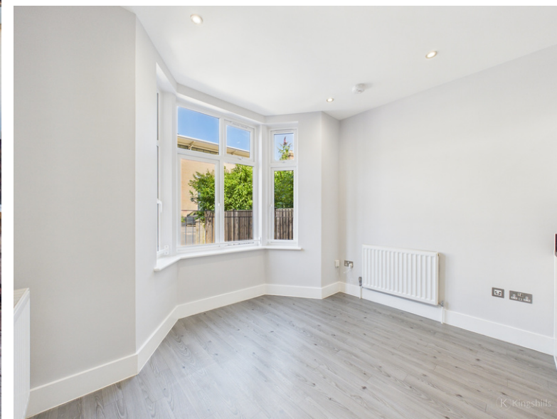
Flat A, Queens Place, 6 Queens Road, High Wycombe, HP13 6AQ