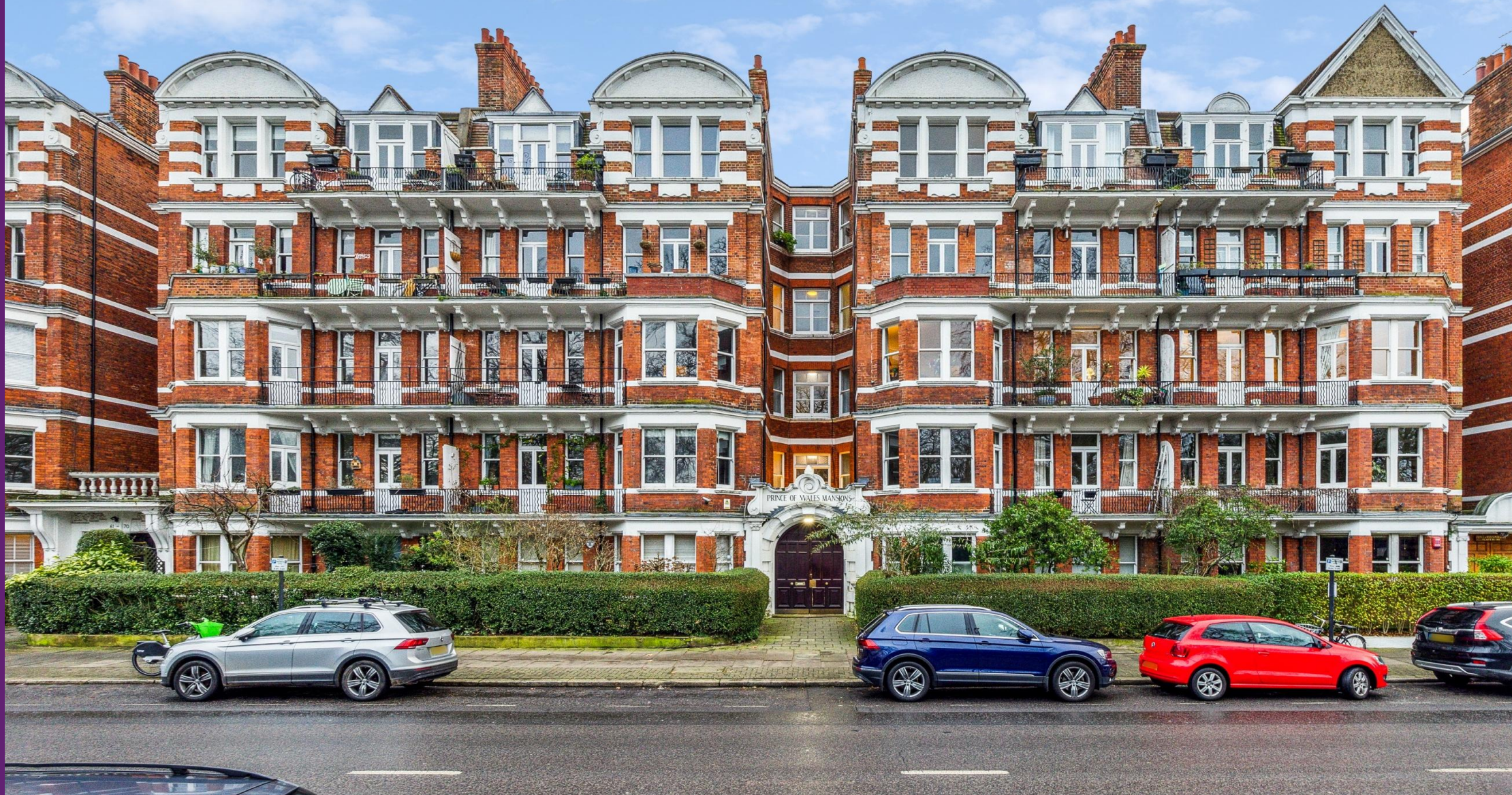
Prince of Wales Mansions Prince of Wales Drive, SW11