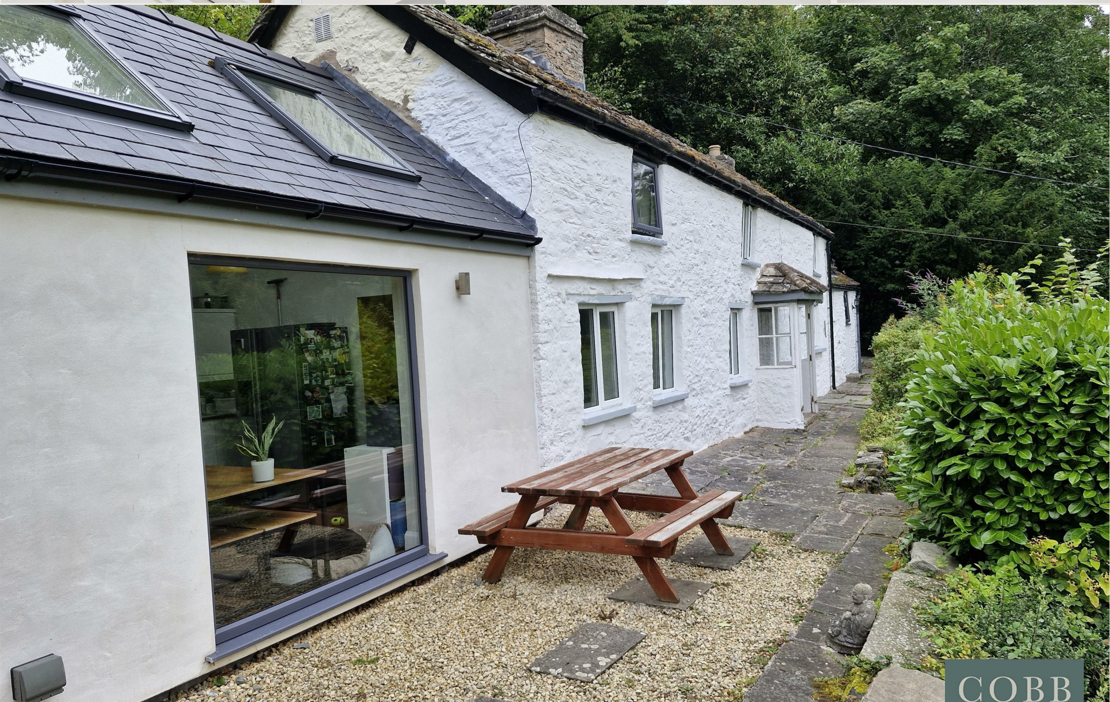
Three Ways, Cusop Dingle, Hereford, HR3 5RQ Price £635,000