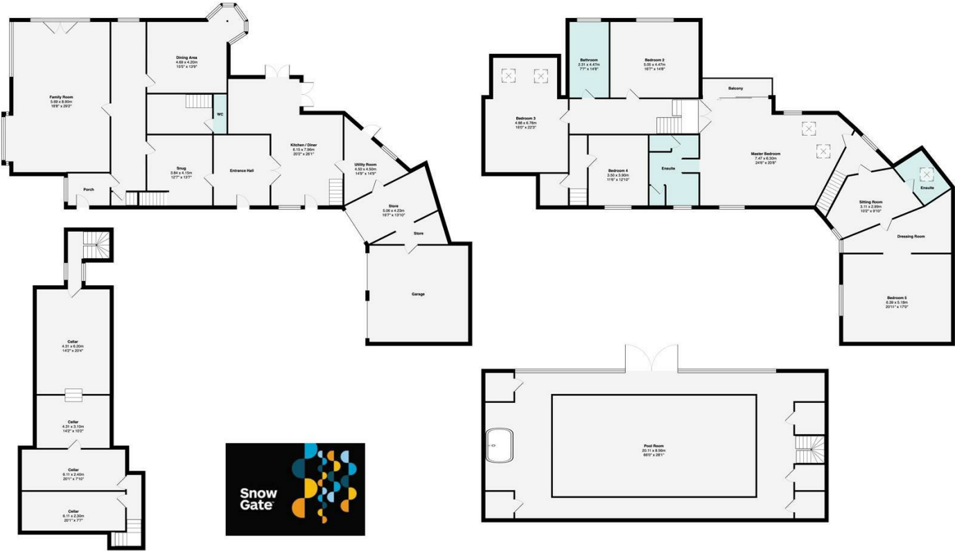
Binna Lane, Holmfirth, HD9 2BU Whilst every effort has been made to ensure the accuracy of the floor plan, measurements of areas, wallings and rooms and any other items are approximate and no responsibility is taken for any errors or omissions in the information. This plan is for illustrative purposes only and should be used as such.

These particulars, whilst believed to be accurate are set out as a general outline only for guidance and do not constitute any part of an offer or contract. Intending purchasers should not rely on them as statements of representation of fact, but must satisfy themselves by inspection or otherwise as to their accuracy. No person in this firm's employment has the authority to make or give any representation or warranty in respect of the property.