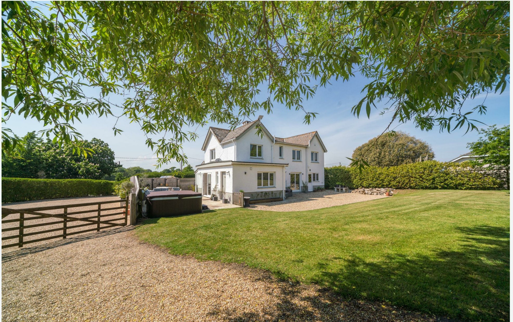
Hillway Corner House, Hillway Road, Bembridge, PO35 5PN