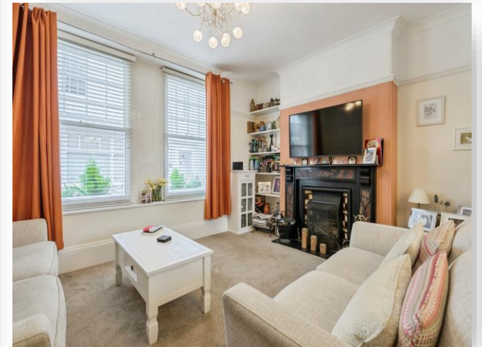
Fore Street, Plympton Plymouth PL7 1LZ