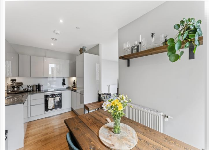
Millwards Court, Greyhound Parade, London SW17 0JQ