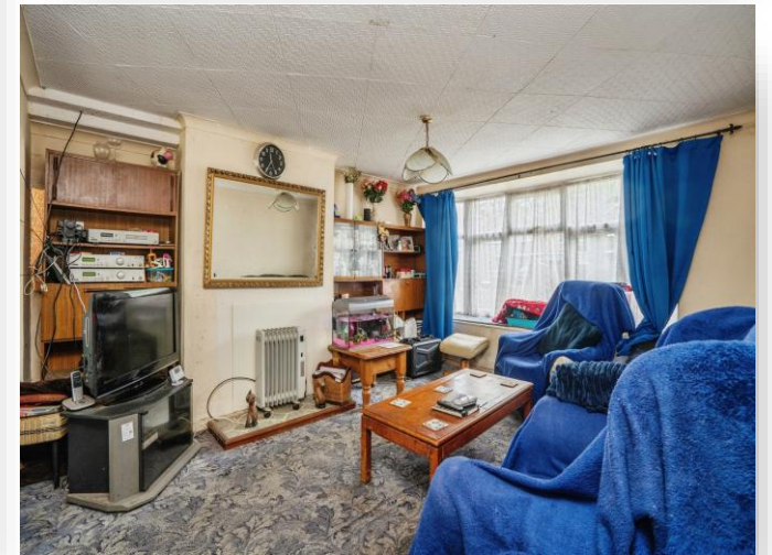
Stakes Hill Road, Waterlooville PO7 7BE