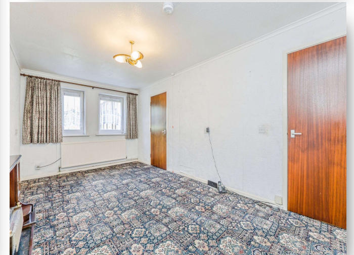
Stephenson Court Wordsworth Avenue, Roath Cardiff CF24 3FX