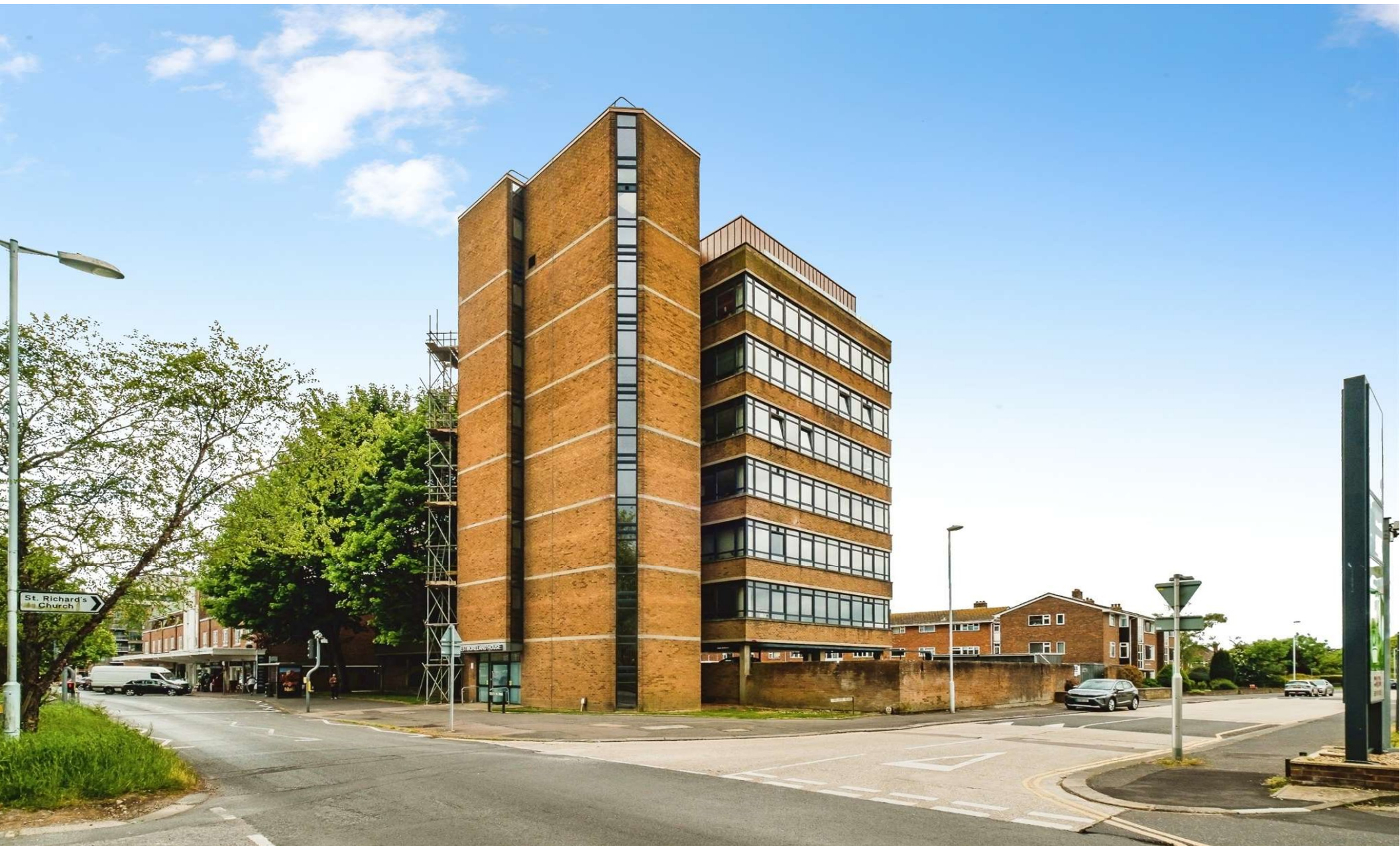
Westmoreland House Strand Parade, Goring-By-Sea Worthing BN12 6FQ