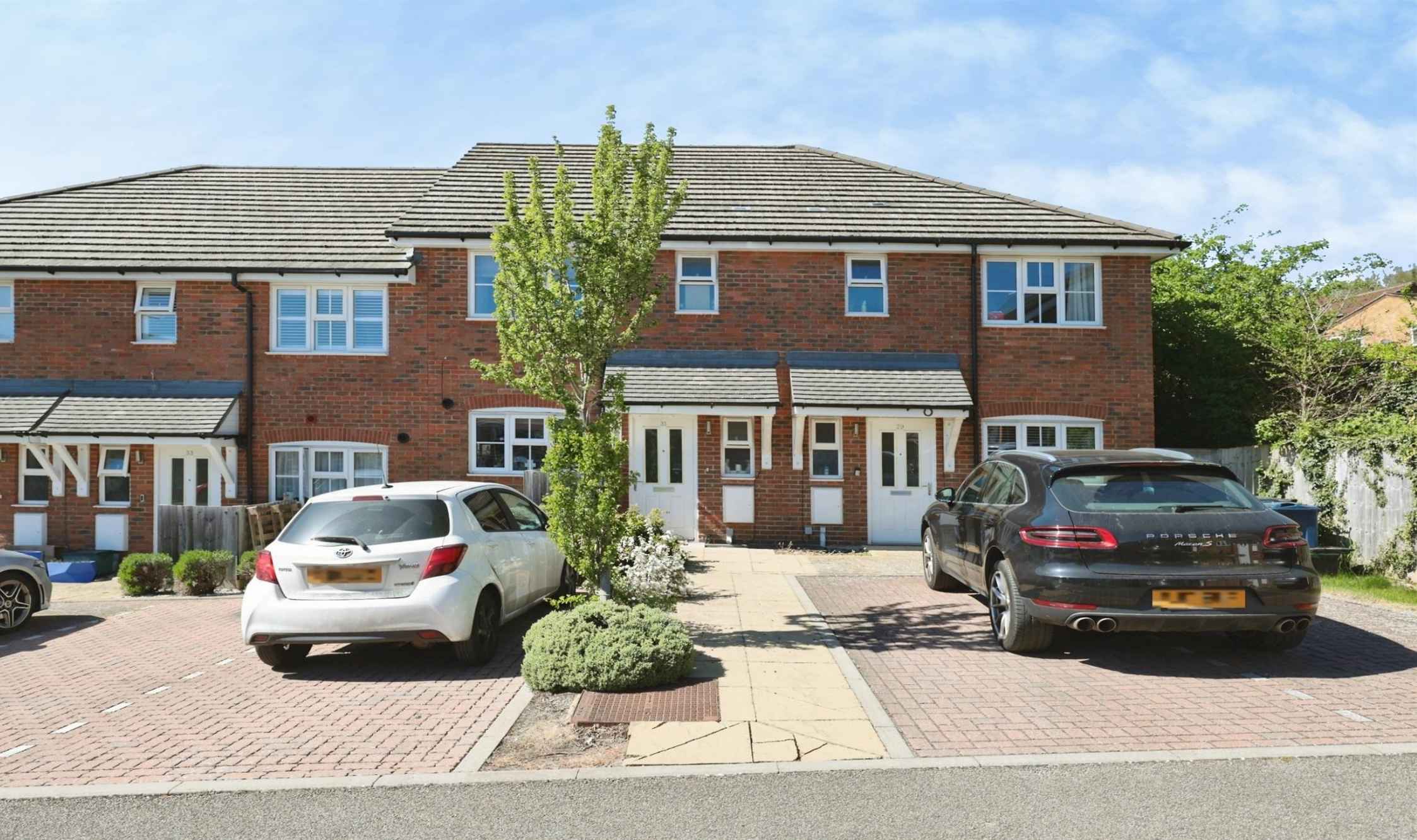
Ash Grove, Chesham HP5 2FU