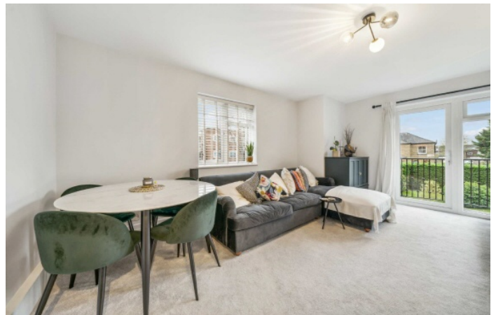
Berrylands Road, KT5