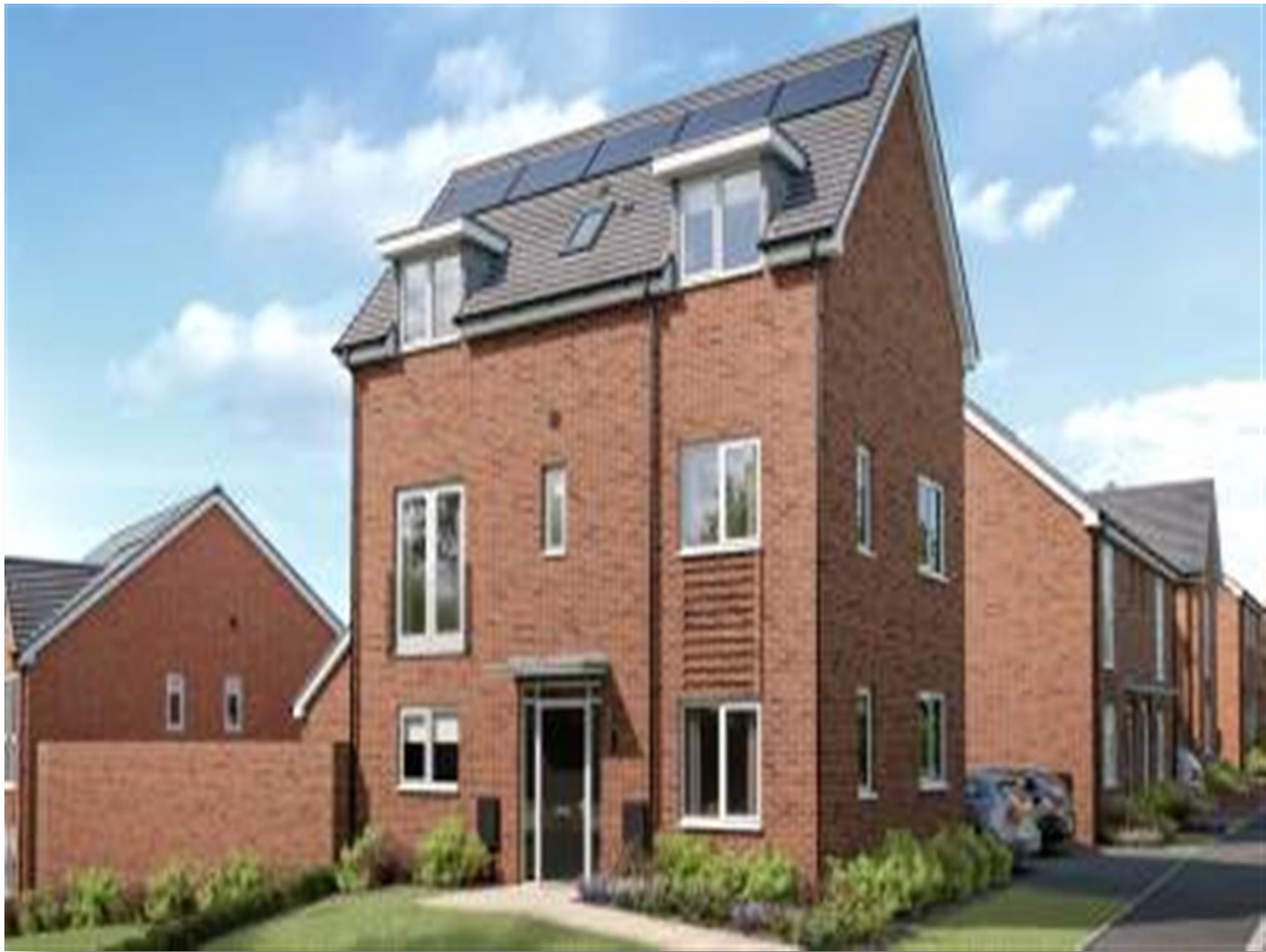
The Paris Chiswell Drive, Coalville LE67 3JX