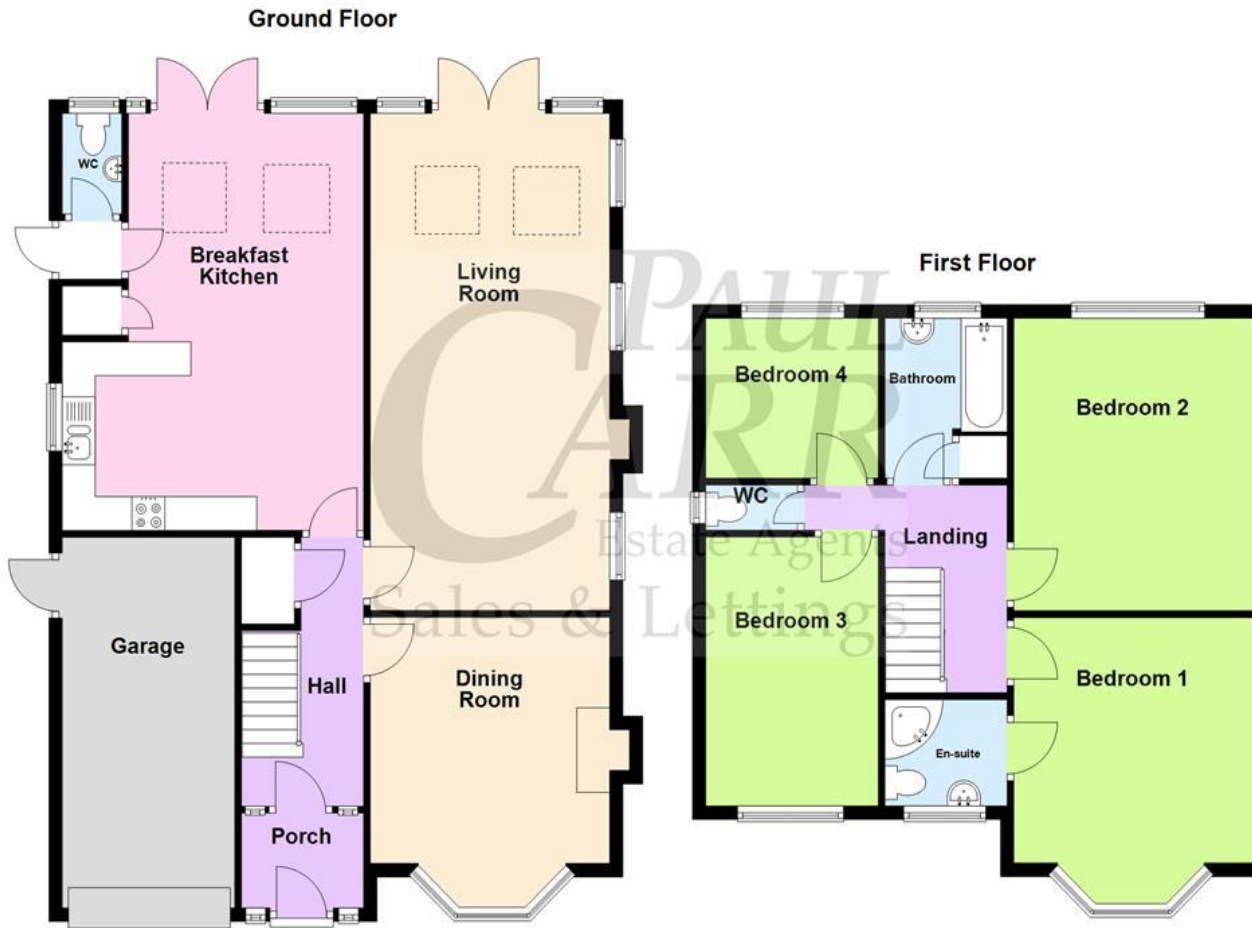
This floorplan is not drawn to scale and is for illustration purposes only Plan produced using PlanUp.

This floor plan is not drawn to scale and is for illustration purposes only