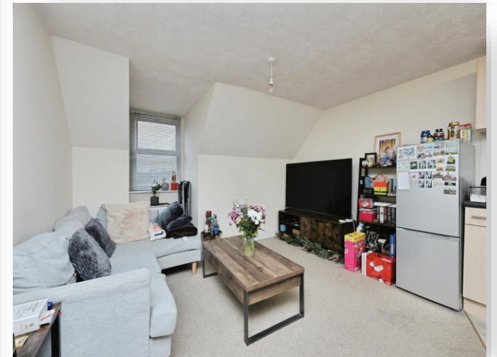
Mawkin Close, Norwich, NR5 9PT