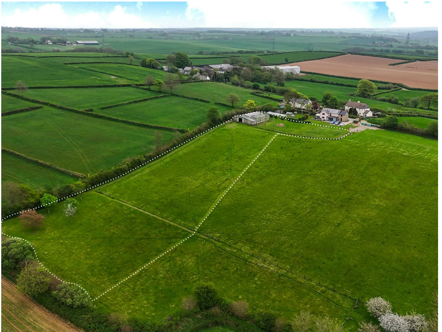
RES Barn in Bulkworthy