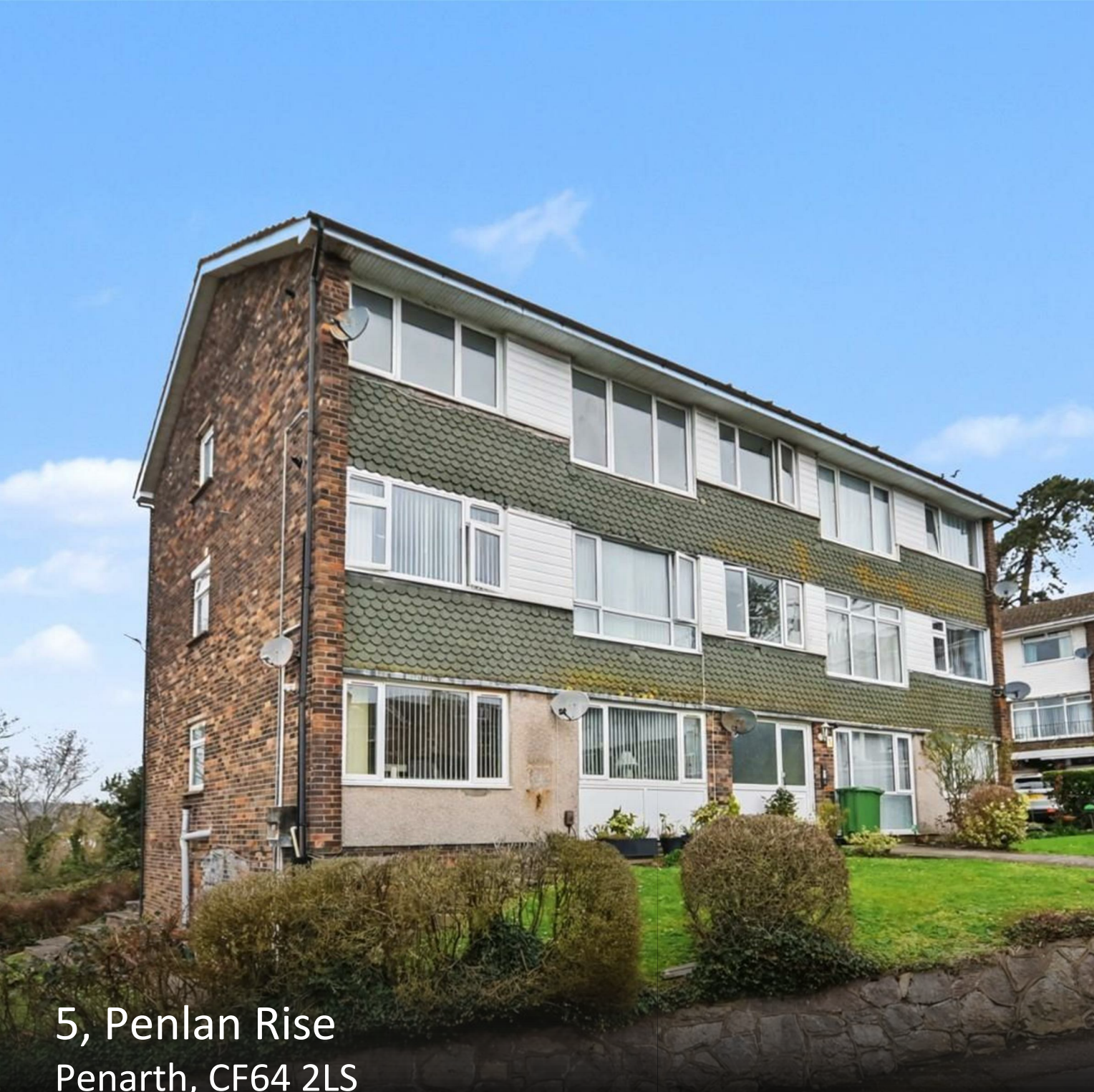
5, Penlan Rise Penarth, CF64 2LS