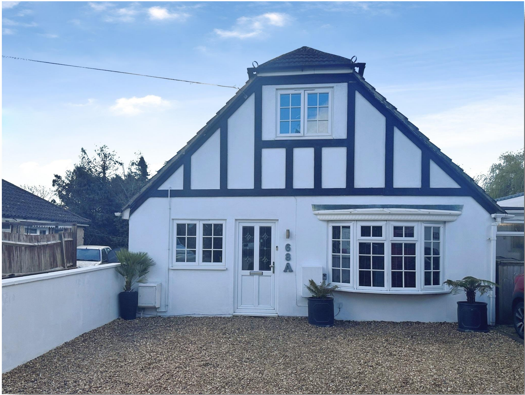
Old Shoreham Road, Lancing BN15 0QZ