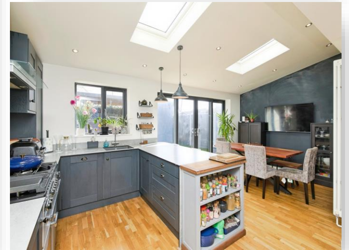
Hollybrook Way, Littleover, Derby, DE23 3TU