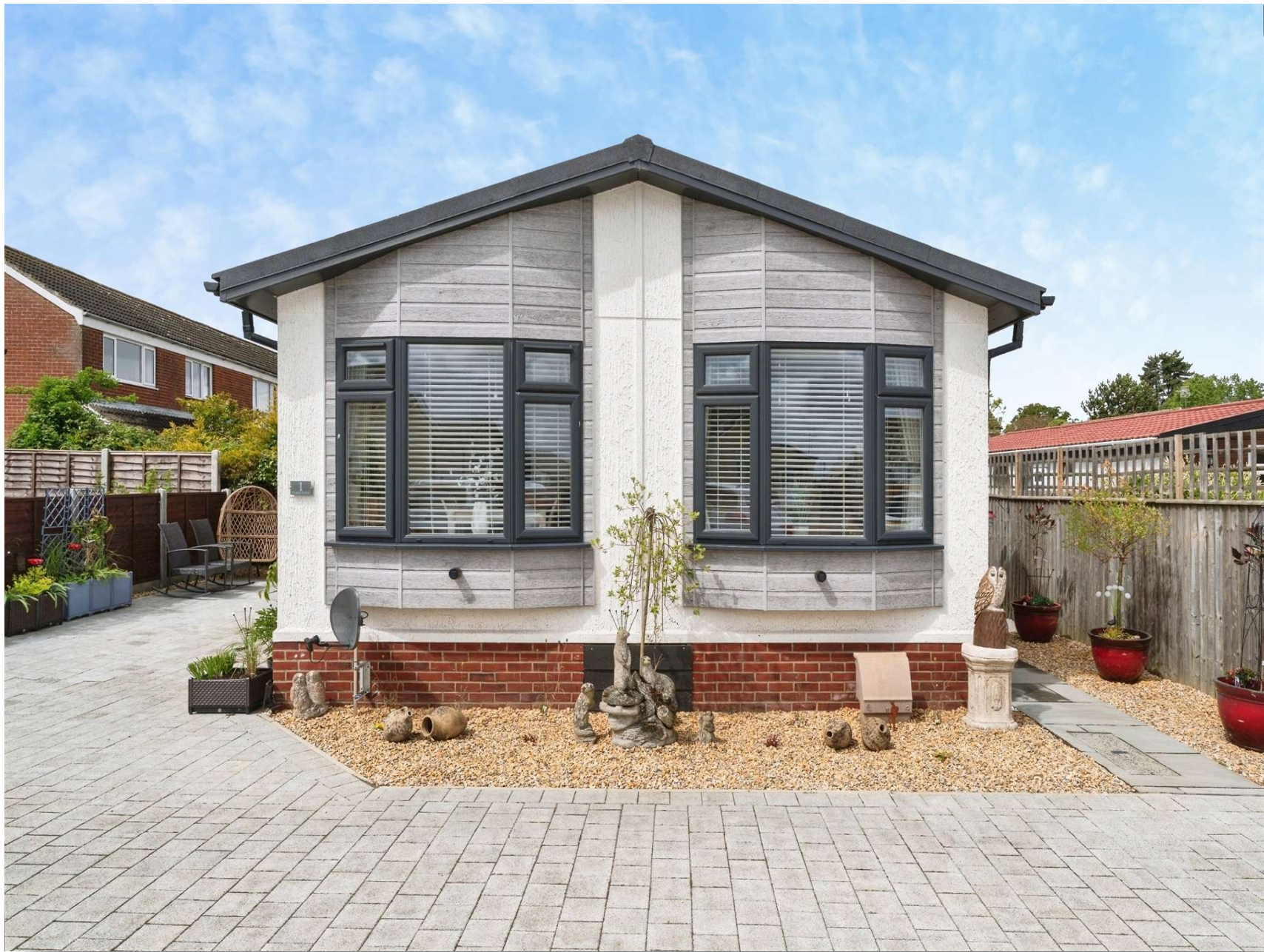
Parklands Green Lane Estate, Pudding Norton, Fakenham NR21