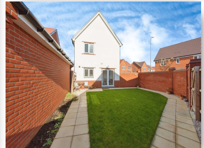
Daffodil Close, Stowupland, Stowmarket, IP14 4FW