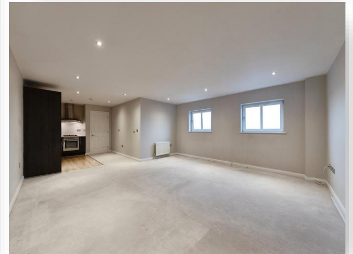
Wharf House Waterside, Shirley Solihull B90 1UE