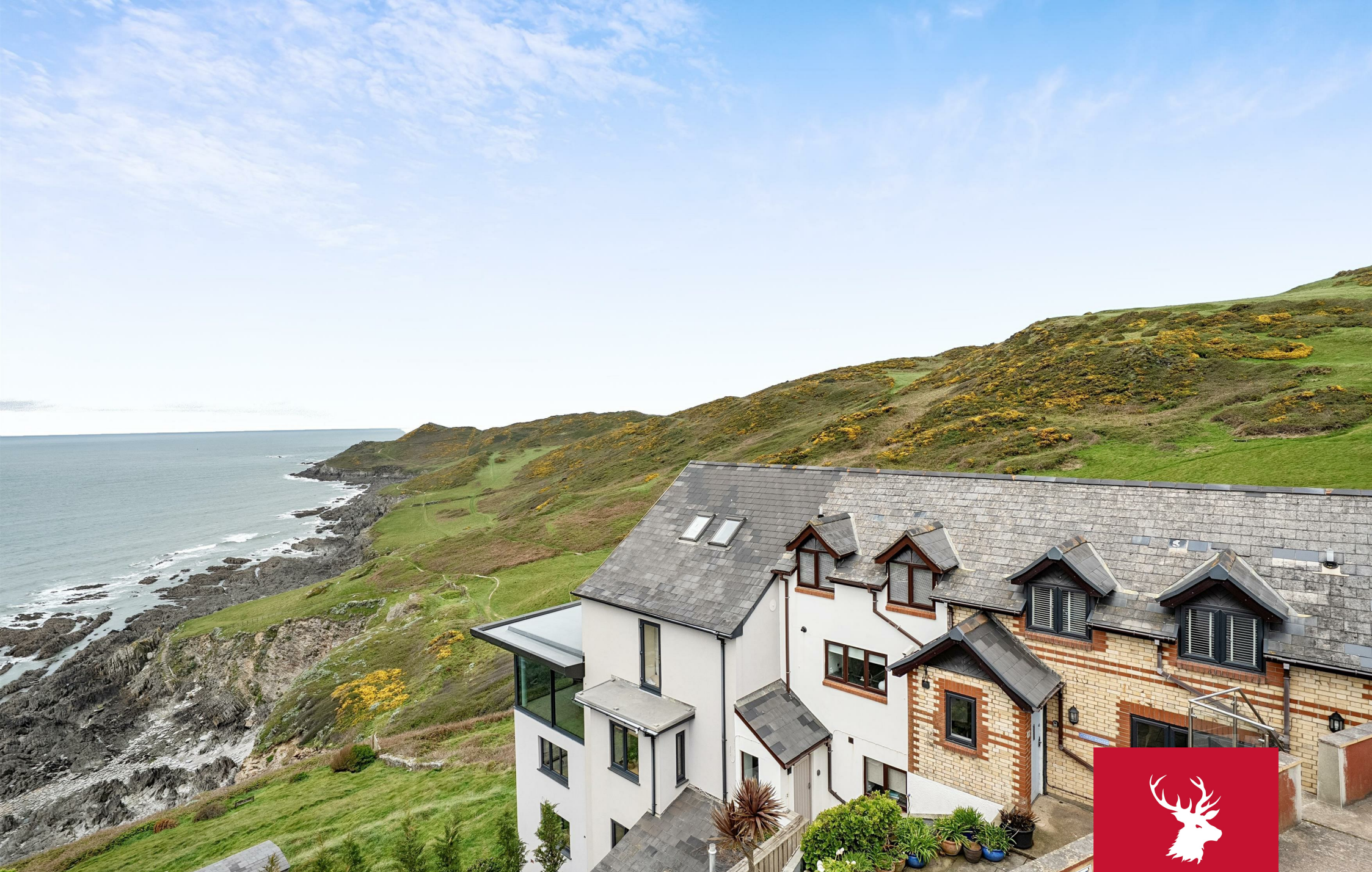
1 Coast House