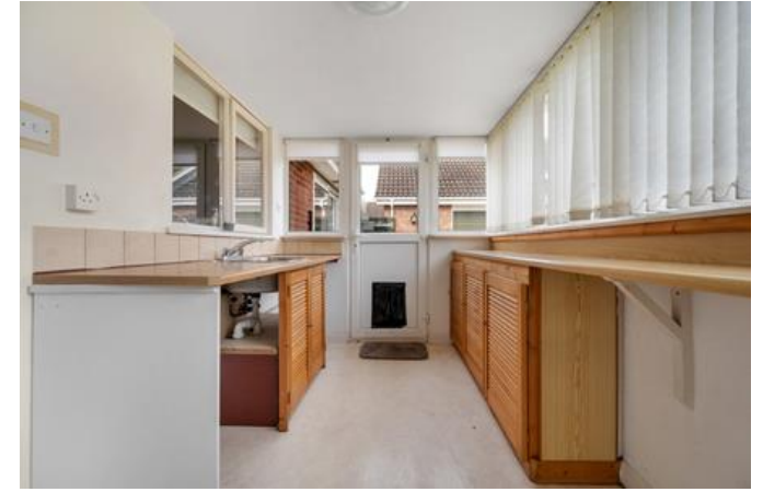
Utility Room 12'0" x 7'0" (3.7m x 2.1m)