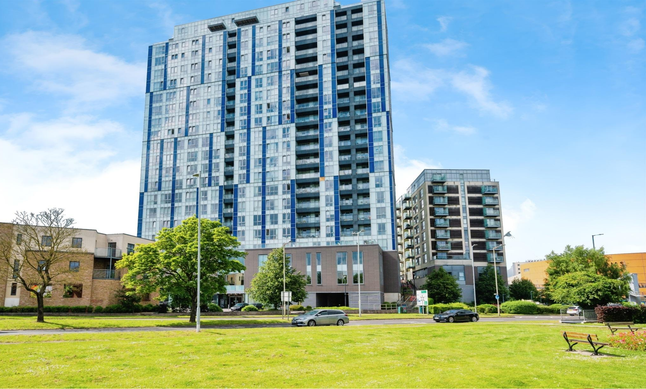
Kd Tower Cotterells, Hemel Hempstead HP1 1AT