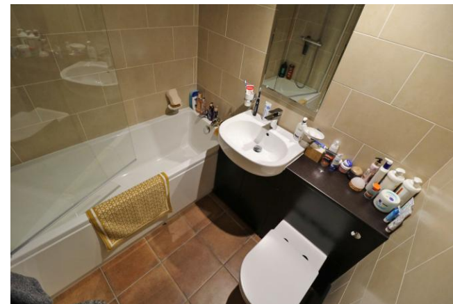
BATHROOM 6' 2" x 5' 5" (1.895m x 1.672m) Vanity sink unit cupboard with WC and display top and vanity mirror. Bath with shower over and side screen. Tiled walls and floor. Ceiling spotlights. Heated towel rail.