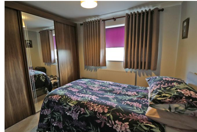
BEDROOM 2 8' 10" x 8' 6" (2.694m x 2.598m) Rear facing window with wonderful open views. Radiator.