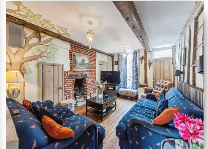
Bury Street, Stowmarket, IP14 1HH