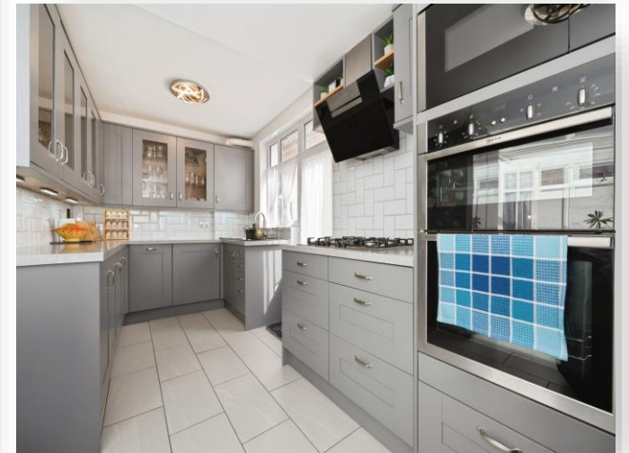
Woodmill Lane, Southampton SO18 2PA