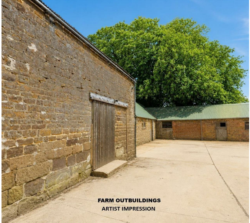
FARM OUTBUILDINGS ARTIST IMPRESSION