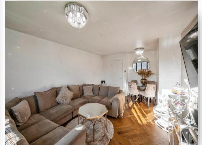
Hamilton Close, Mexborough S64 0QW