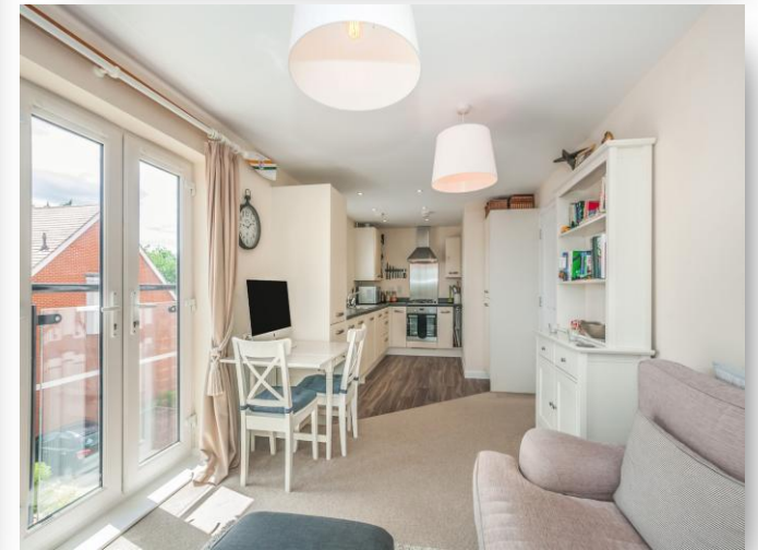
Flat 7, 1 Horsley Road, Maidenhead SL6 7RL