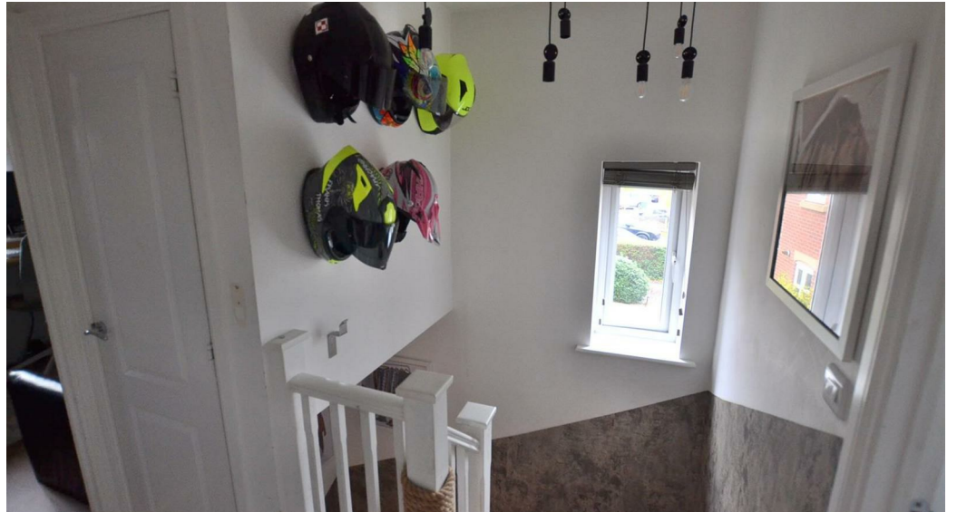
25 Highreeds End, Sileby, Leicestershire, LE12 7WN