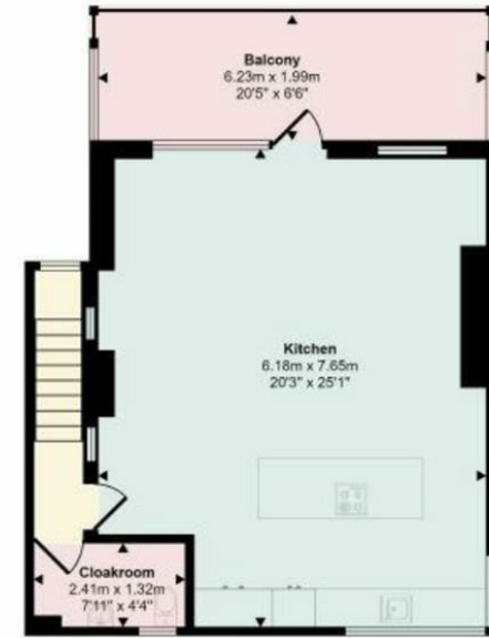
Second Floor Approx 53 sq m / 565 sq ft

This floorplan is only for illustrative purposes and is not to scale. Measurements of rooms, doors, windows, and any items are approximate and no responsibility is taken for any error, omission or mis-statement. Icons of items such as bathroom suites are representations only and may not look like the real items. Made with Made Snappy 360.