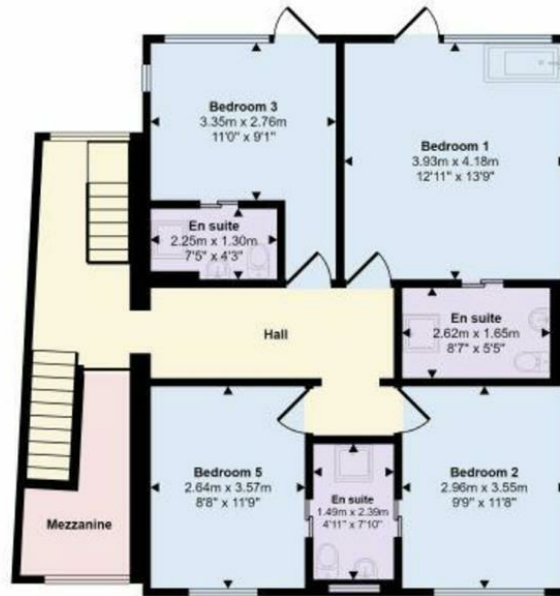
First Floor Approx 81 sq m / 867 sq ft