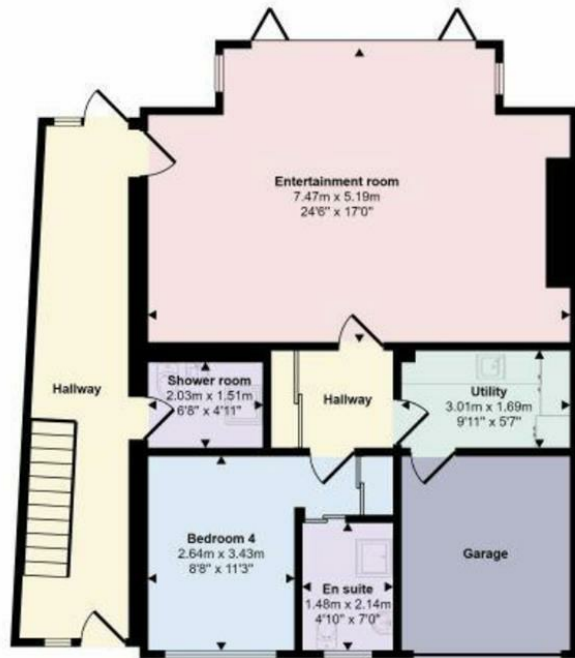
Ground Floor Approx 94 sq m / 1015 sq ft

Approx Gross Internal Area 227 sq m / 2448 sq ft