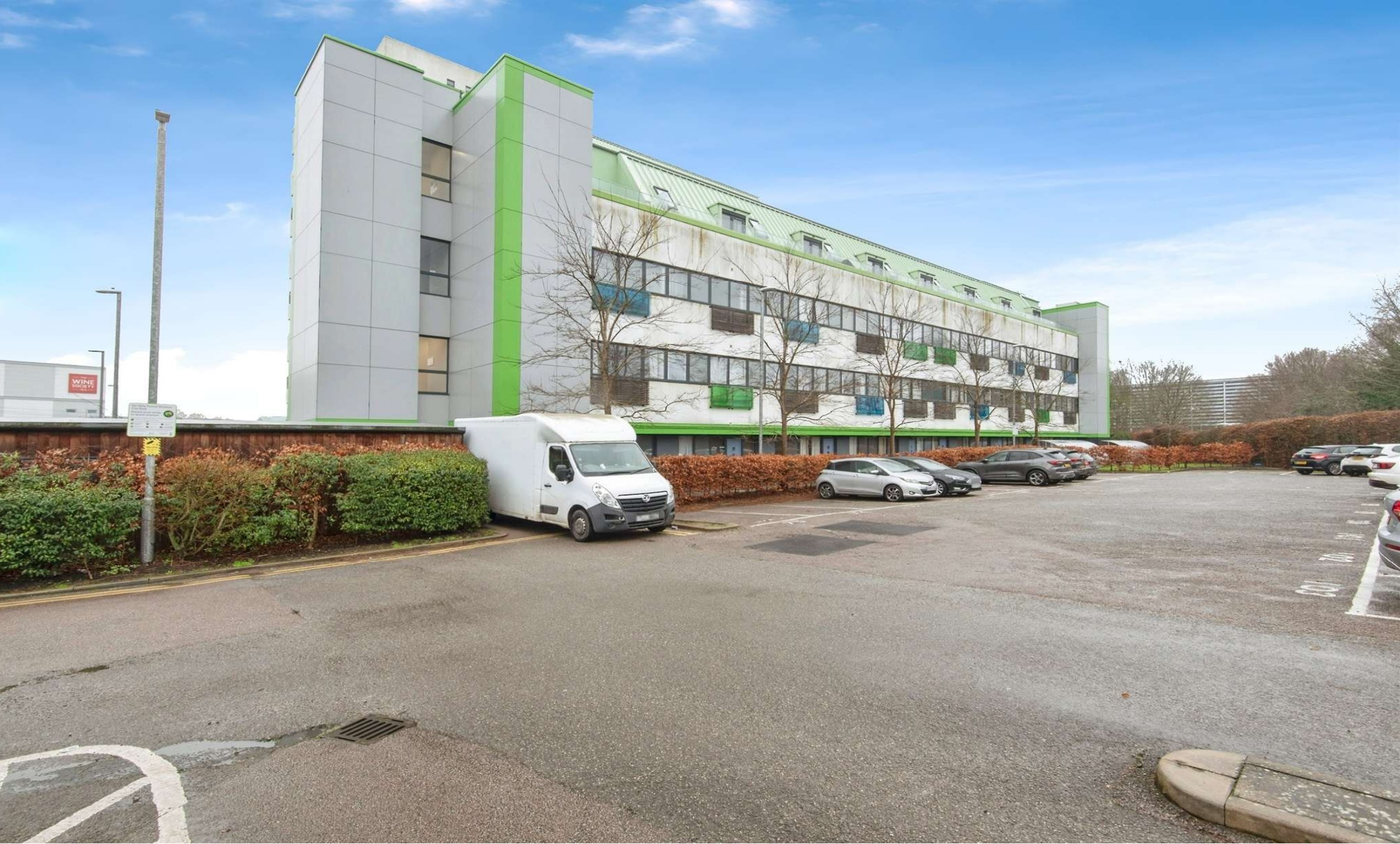
Six Hills House, Kings Road, Stevenage, SG1 1AU