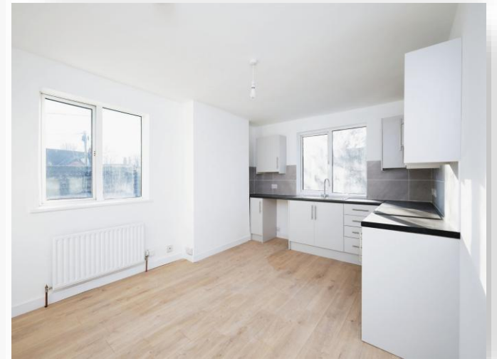
Scarborough Avenue, Skegness PE25 2TA