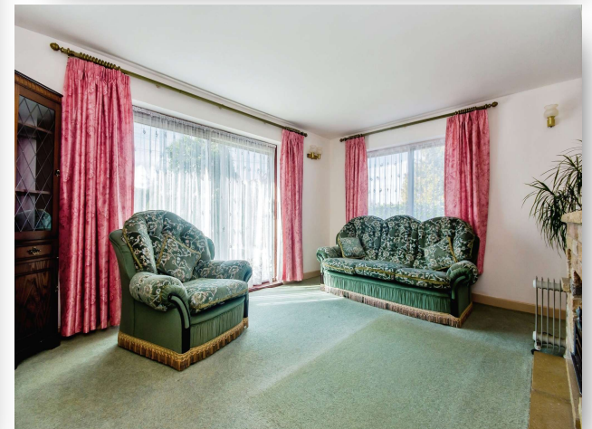
Captains Hill, Leasingham Sleaford NG34 8JP