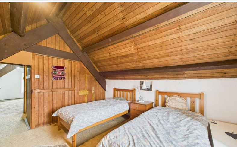
Occasional Attic Room One