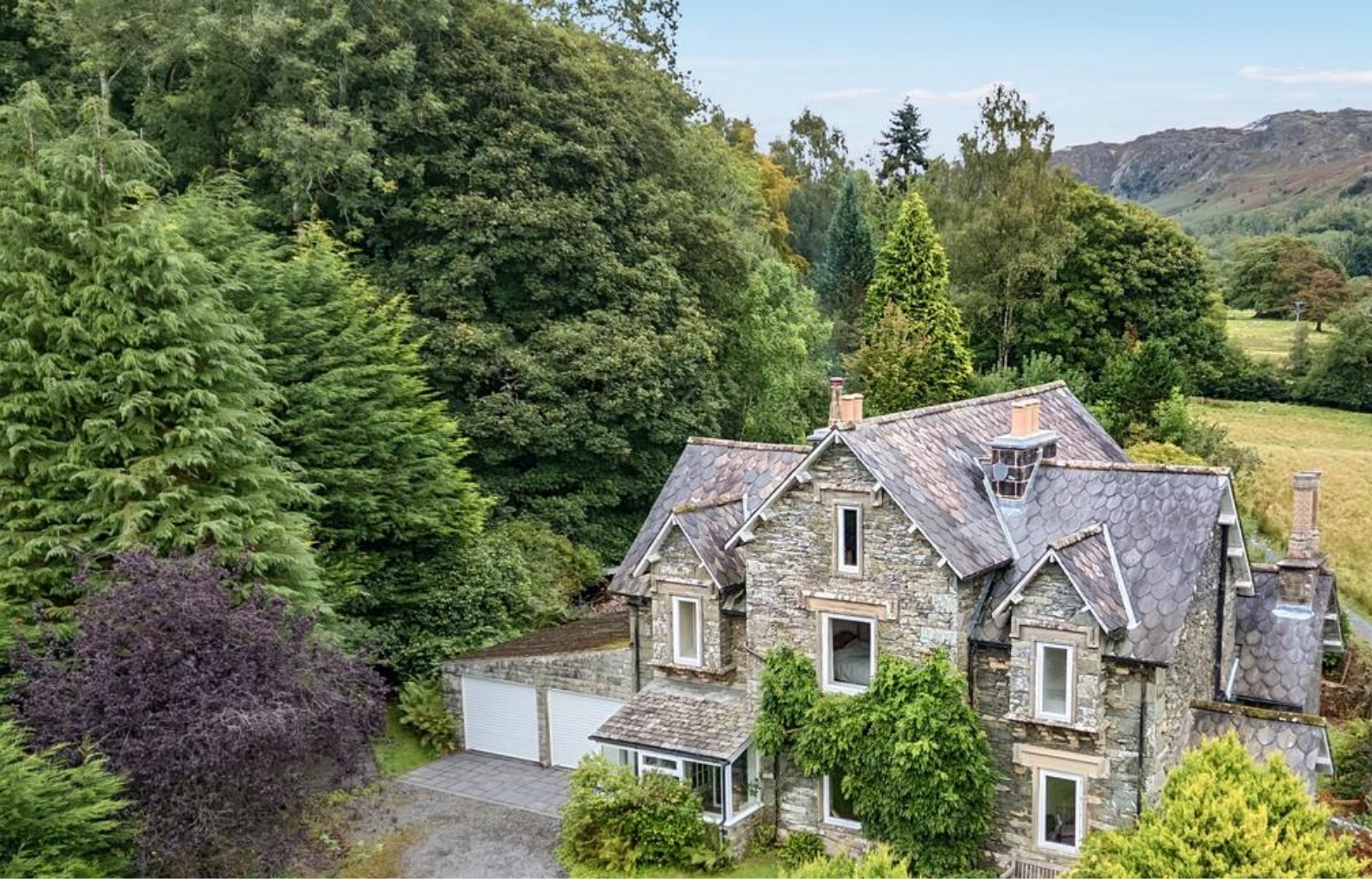
External of Property