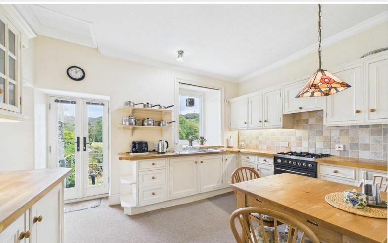
Farmhouse Style Kitchen

Property Description Duddon Gardens is an exceptional mid Victorian detached home, set within the historic Duddon Hall Estate in the heart of the Lake District National Park. Combining timeless period character with modern comforts, it offers a lifestyle defined by tranquillity, space, and understated elegance.