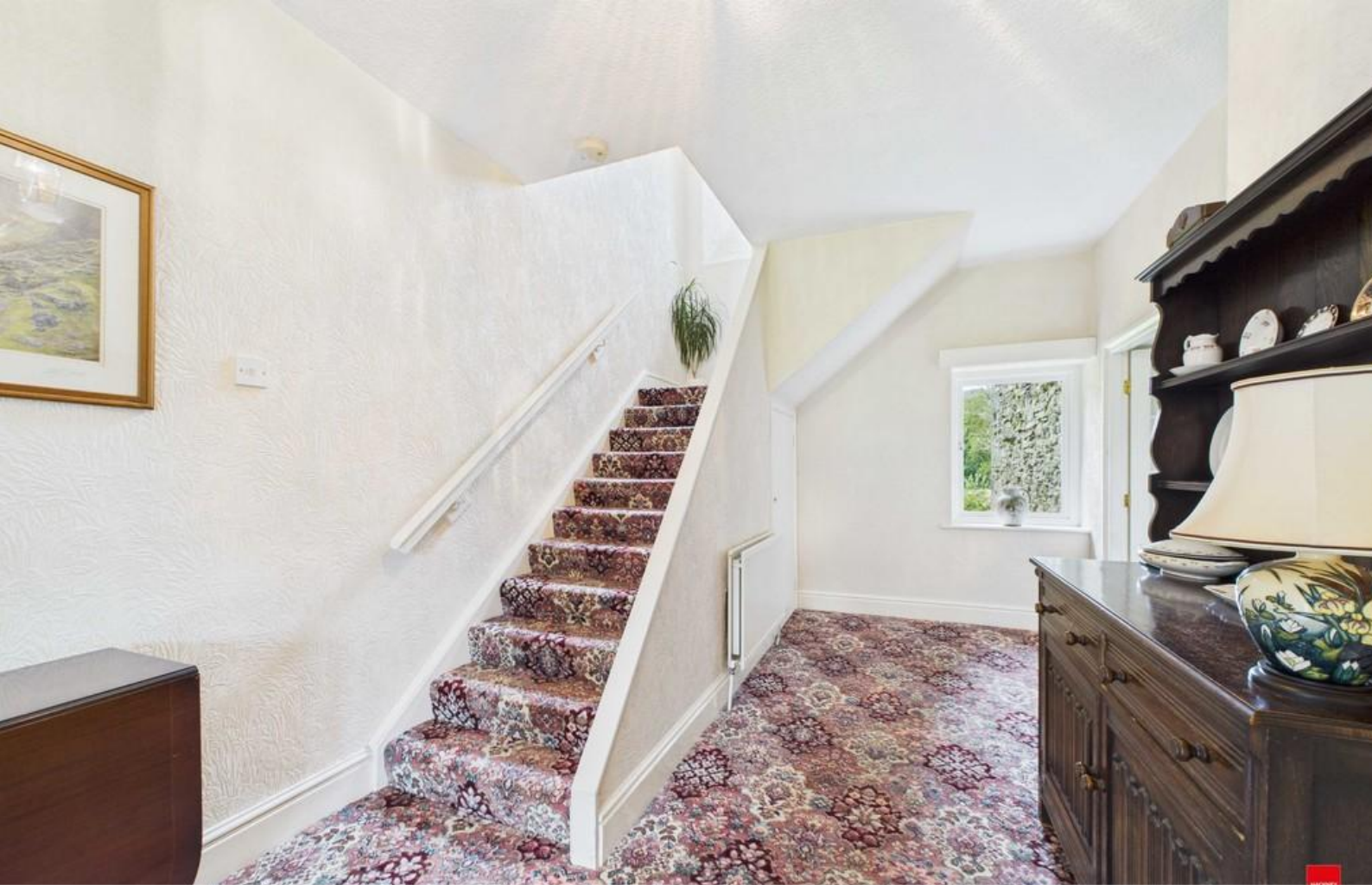
Staircase and Hallway