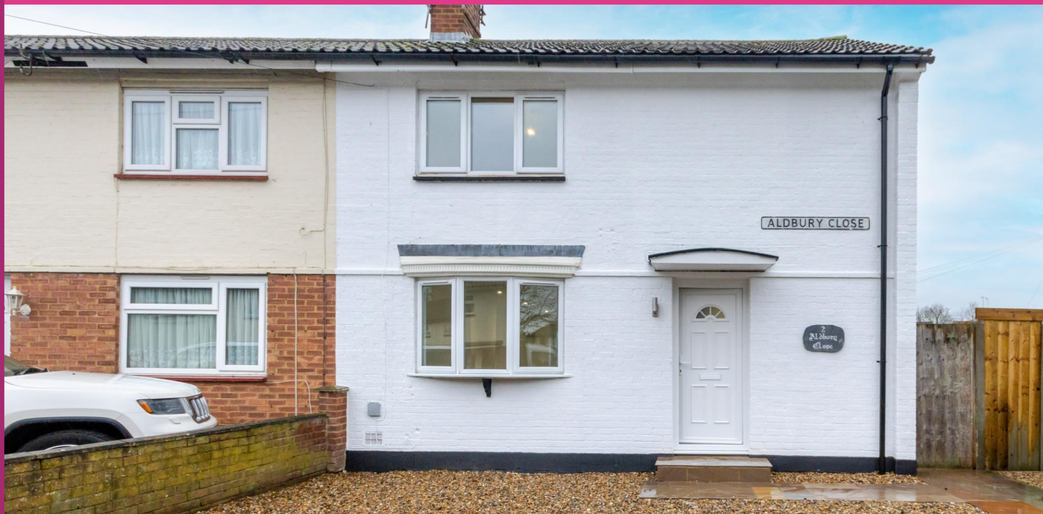
ALDBURY CLOSE, WATFORD - £500,000 3 Bedroom End Terraced House