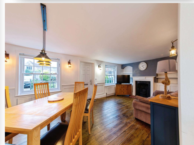
North Street, Osbournby Sleaford NG34 0DR