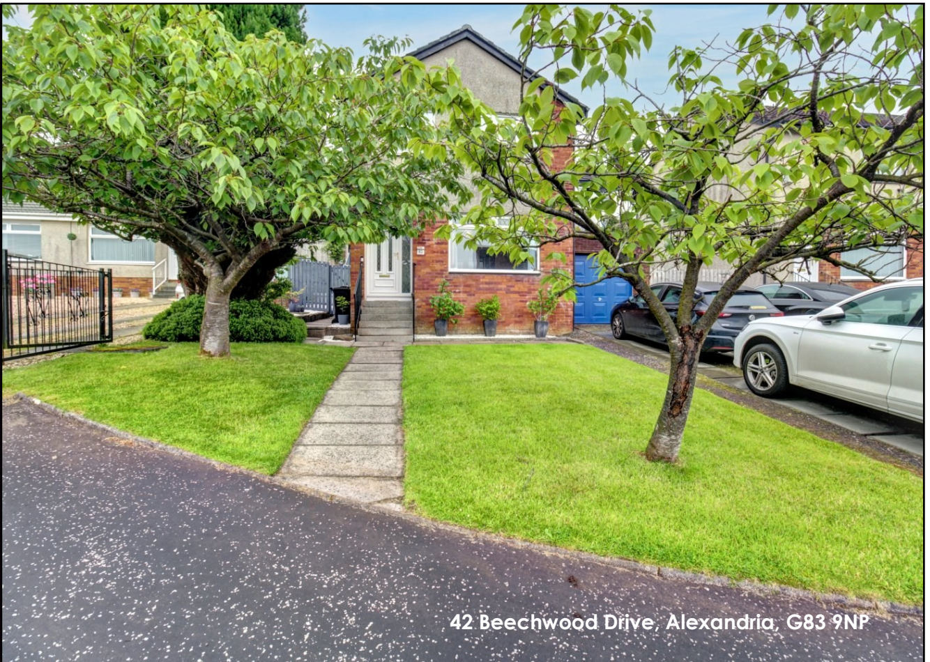
42 Beechwood Drive, Alexandria, G83 9NP

Set within one of Beechwood Estate's most desirable cul-de-sacs, this impressive three-bedroom detached villa occupies a substantial plot and offers exceptional family living with a refined finish throughout.