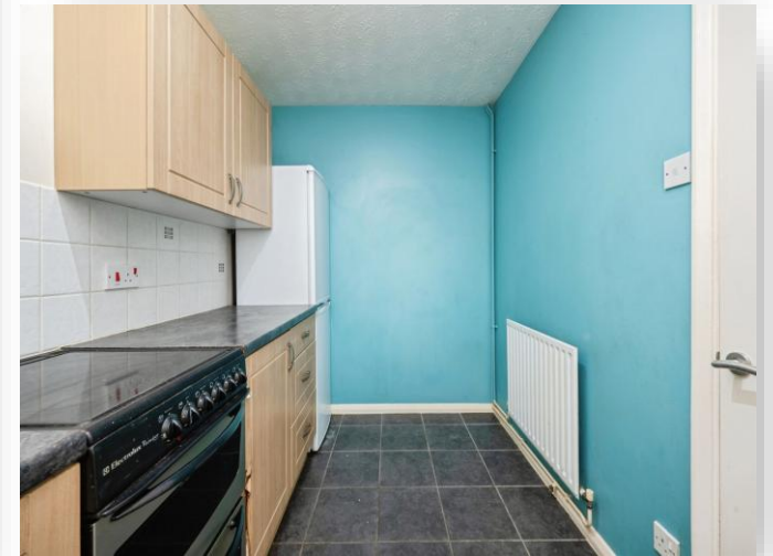
Fyne Drive, Linslade, Leighton Buzzard, LU7 2YG