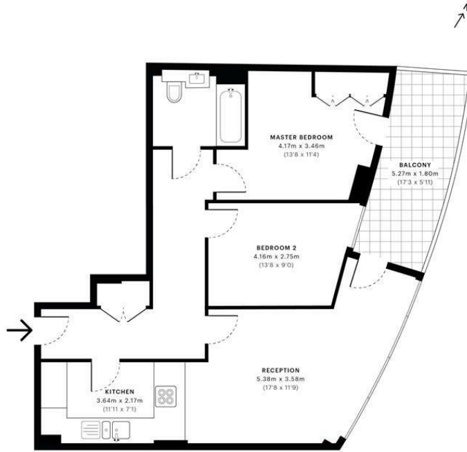
— First Floor