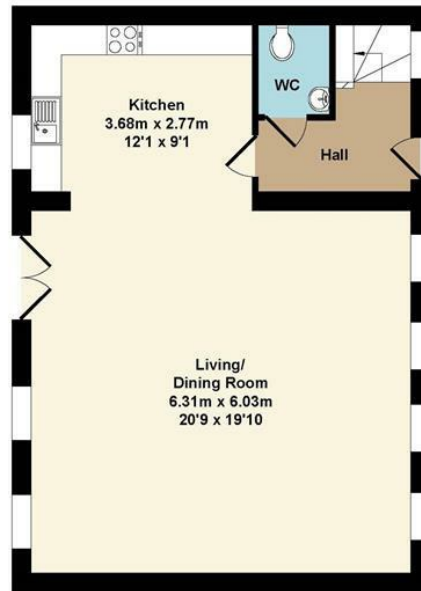
Ground Floor Approx. Floor Area 57.50 Sq.M. (619 Sq.Ft.)

Whilst every attempt has been made to ensure the accuracy of the floor plan contained here, measurements of doors, windows, rooms and any other items are approximate and no responsibility is taken for any error, omission, or mis-statement. This plan is for illustrative purposes only and should be used as such by any prospective purchaser. The services, systems and appliances shown have not been tested and no guarantee as to their operability or efficiency can be given.