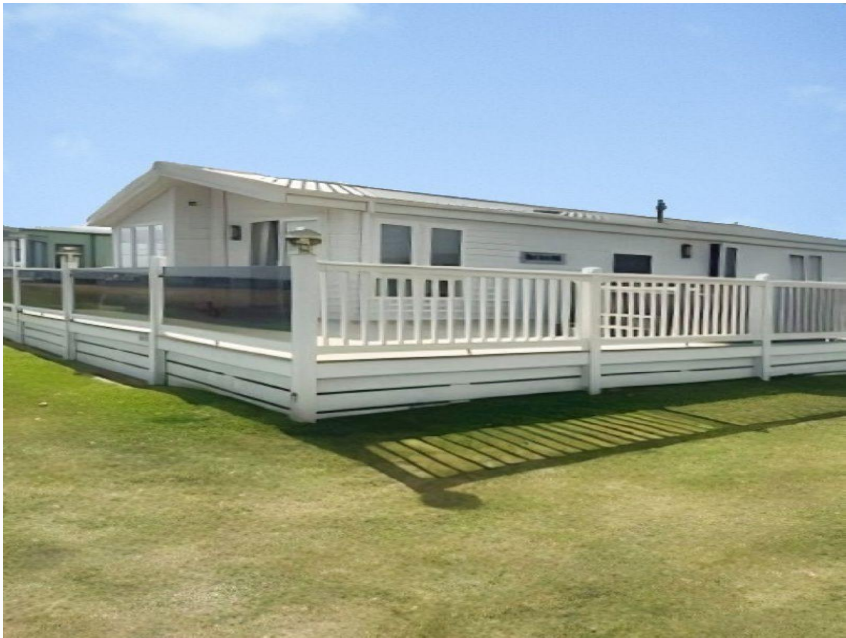
The Meadows Crimdon Dene Park, Blackhall Colliery Hartlepool TS27 4BN