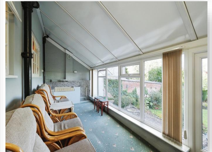
Derby Road, Kegworth