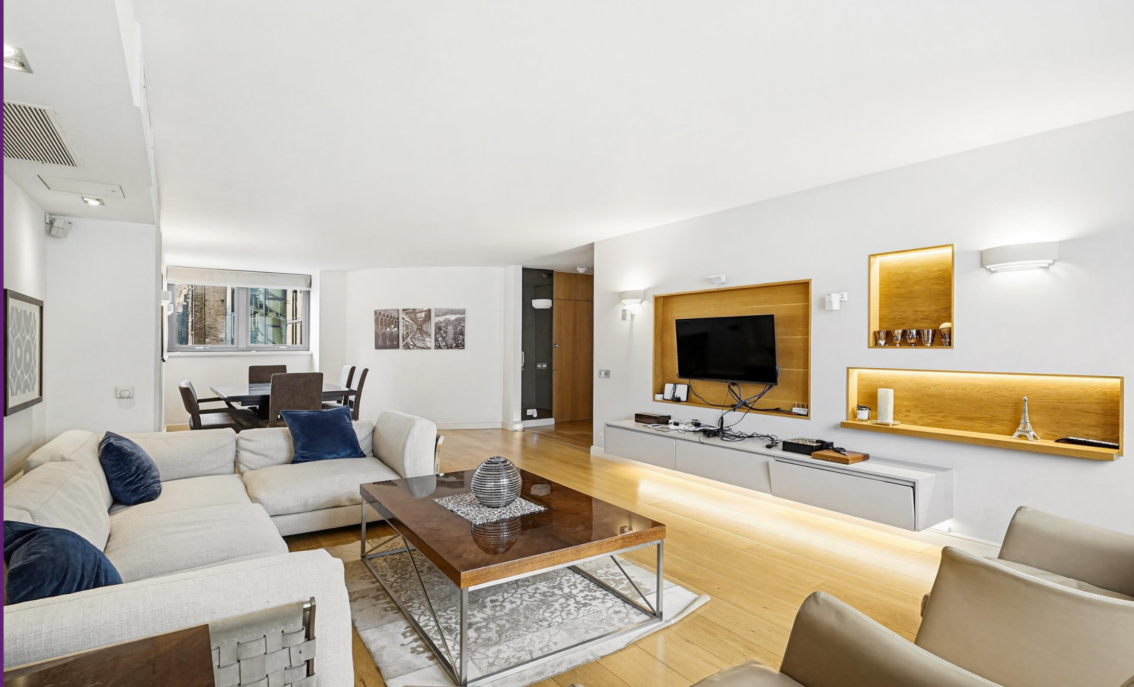
Bolebec House Lowndes Street, SW1X