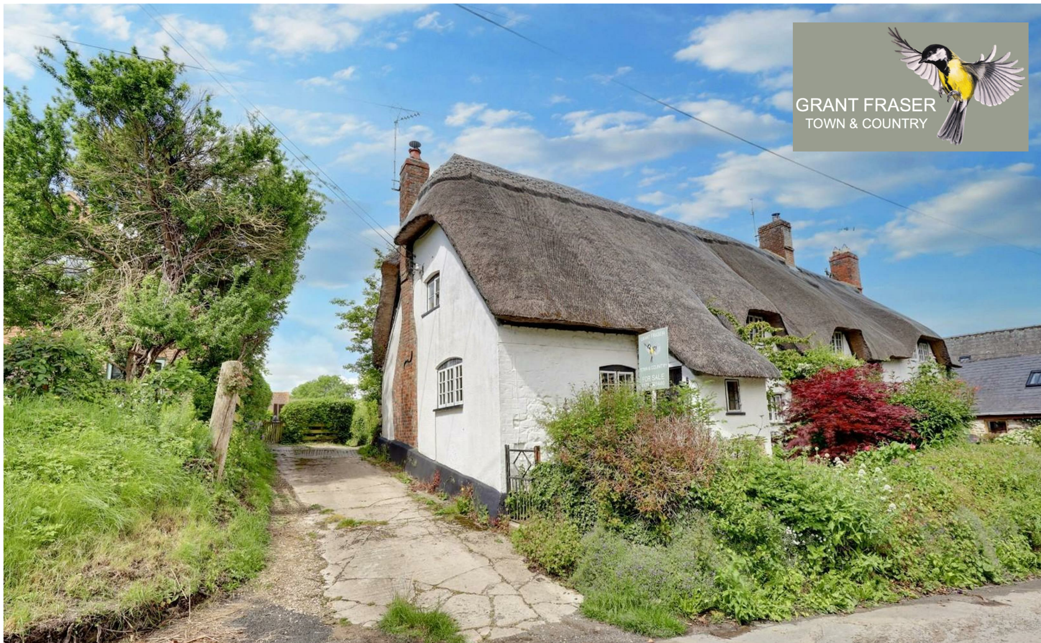
Greystones, Church Row, Hinton Parva, Swindon, Wiltshire, SN4 0DW Offers over £375,000