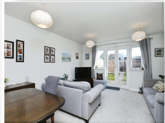
Pastures Loke, North Tuddenham Dereham NR20 3FU